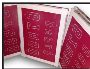
Complete kits include pre-exposed screens. Choose from 7 available fonts.

Film positives, blank screens also available