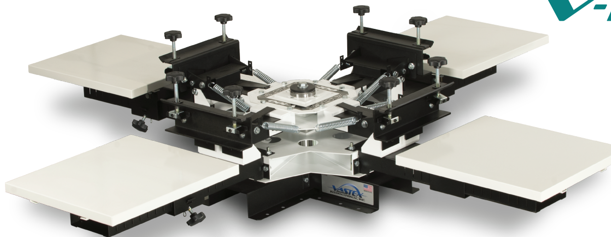
V100-44 4 Station/4 Color Tabletop Press*