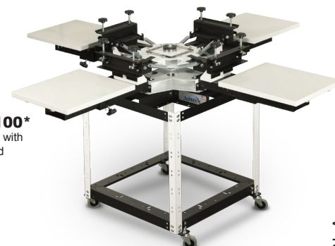
V100-44* w/ S-100* 4 station, 4 color shown with optional S-100 stand

* Press comes unassembled with easy step by step assembly instructions.